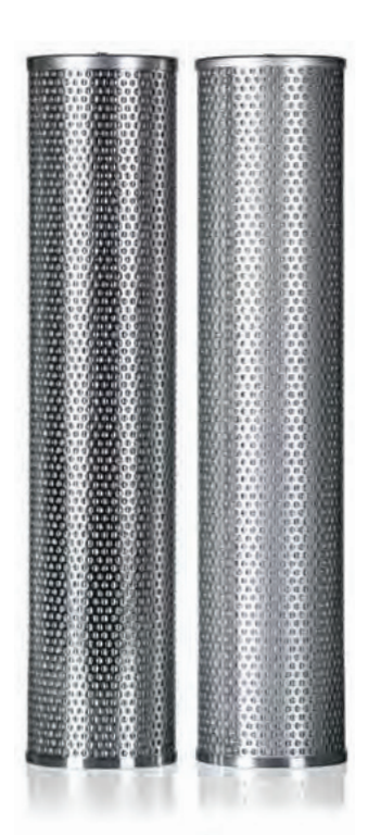
SAMPLE LUBE OIL AND LIQUID FUEL FILTERS