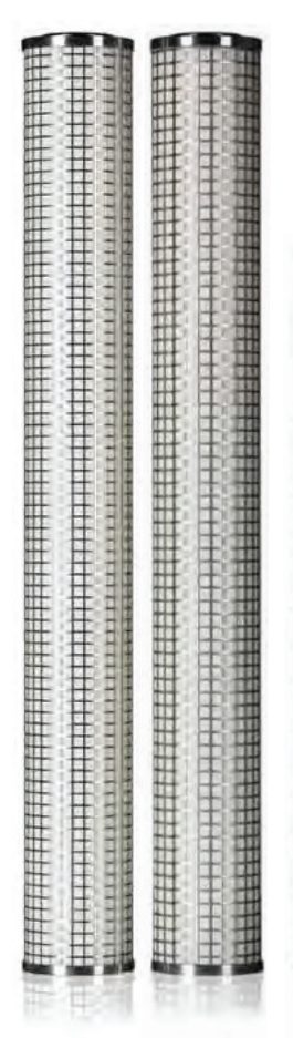
SAMPLE FUEL GAS FILTERS